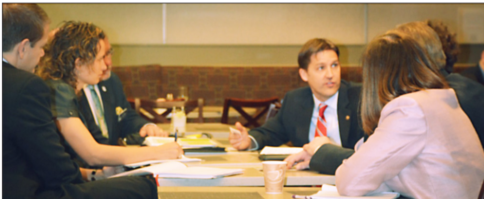
HEA Board and Ports-to-Plains Alliance members meet with Nebraska U.S. Senator Ben Sasse after the Nebraska Breakfast in Washington, D.C.