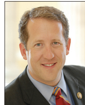
Adrian Smith U.S. Congressman Third District NE

"The Heartland Expressway is the central portion of a crucial trade corridor known as Ports-to-Plains. This corridor plays an important role in connecting rural communities and allowing them to more safely and efficiently get their products to market. The Ports-to-Plains corridor annually generates approximately $166.7 billion in trade with Canada and Mexico, nearly 20 percent of all U.S. North American trade.