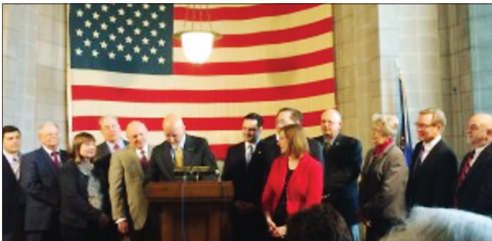
In April 2016, Governor Pete Ricketts signs the Nebraska Transportation Innovation Act into law, which will allocate a total of $450 million to Nebraska projects.