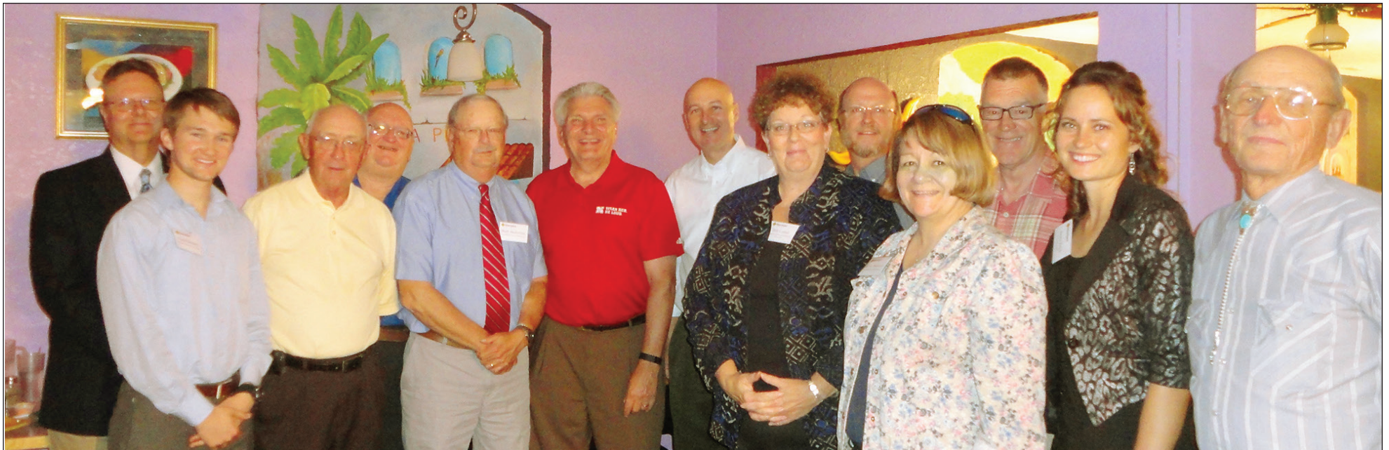
Heartland Expressway board members meet with Governor Pete Ricketts and Sen. John Stinner at Rosita's Restaurant in Scottsbluff.